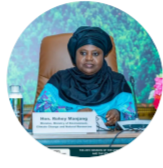
H.E. Honourable Rohey John Manjang Minister of Environment, Climate Change & Natural Resources, The Gambia