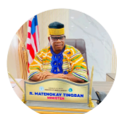
Honourable R. Matenokay Tingban

Minister of Universal Access to Water &amp; Energy, Gabon