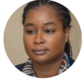
H.E. Honourable Djami Diallo Minister of Environment & Sustainable Development, Guinea