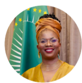
H.E. Honourable Lerato Mataboge African Union Commissioner for Infrastructure and Energy