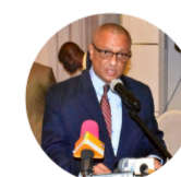
H.E. Honourable Thierry Kamach

Minister of Environment &amp; Sustainable Development, Guinea