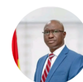
H.E. Honourable Laye Sekou Camara

Minister of Minerals &amp; Energy, Botswana