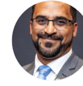
H.E. Honourable Tertuis Simmers Provincial Minister of Infrastructure, Western Cape Government, South Africa