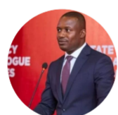
H.E. Honourable John Abdulai Jinapor

Minister of Energy &amp; Green Transition, Ghana