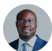
H.E. Honourable Casseil Ato Forson

Minister of Energy &amp; Green Transition, Ghana