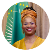
H.E. Honourable Lerato Mataboge African Union Commissioner for Infrastructure and Energy