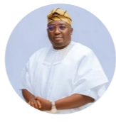
H.E. Honourable Adebayo Adelabu Minister of Power, Nigeria