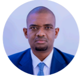
H.E. Honourable Deogratius John Ndejemi Minister of Energy, Tanzania