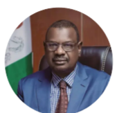
Sule Ahmed Abdulaziz

CEO, Office National de l'Electricité et de l'Eau Potable (ONEE), Morocco