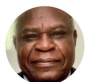
H.E. Honourable Philippe Tonangoye

Minister of Energy &amp; Water, Cameroon