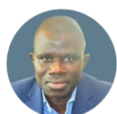
H.E. Honourable Nani Juwara

Minister of the Environment &amp; Sustainable Development, Central African Republic