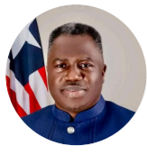
H.E. Honourable Jeremiah Kpan Koung Vice President, Liberia