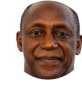
H.E. Honourable Dr. Kandeh Yumkella Chairman, The Presidential Initiative for Climate Change, Renewable Energy & Food Security, Sierra Leone