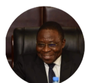
H.E. Honourable Gaston Eloundou Essomba

Minister of Energy &amp; Water, Cameroon