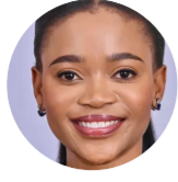
H.E. Honourable Bogolo Joy Kenewendo Minister of Minerals & Energy, Botswana