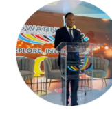
His Royal Highness (HRH) Prince Lonkhokhela Dlamini Minister of Natural Resources & Energy, Eswatini