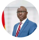
H.E. Honourable Laye Sekou Camara Minister of Energy, Guinea