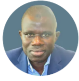
H.E. Honourable Nani Juwara Minister of Petroleum, Energy & Mines, The Gambia