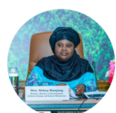
H.E. Honourable Rohey John Manjang

Minister of Petroleum, Energy &amp; Mines, The Gambia