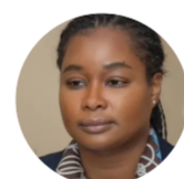
H.E. Honourable Djami Diallo

Minister of Environment &amp; Sustainable Development, Guinea