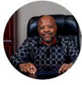
H.E. Honourable Mohlomi Moleko Minister of Natural Resources & Energy, Lesotho