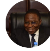
H.E. Honourable Gaston Eloundou Essomba Minister of Energy & Water, Cameroon