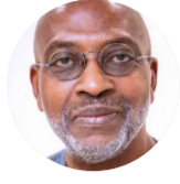
H.E. Honourable Cyril Grant Minister of Energy, Sierra Leone