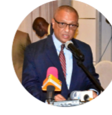
H.E. Honourable Thierry Kamach Minister of the Environment & Sustainable Development, Central African Republic