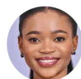
H.E. Honourable Bogolo Joy Kenewendo

Minister of Minerals &amp; Energy, Botswana