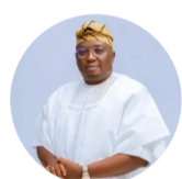
H.E. Honourable Adebayo Adelabu