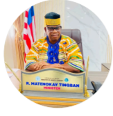
Honourable R. Matenokay Tingban Minister of Mines & Energy, Liberia